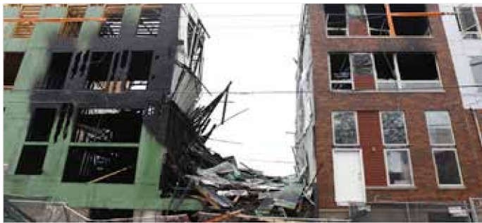
ANTI-GENTRIFICATION DIRECT ACTIONS PHILADELPHIA 2013 - 2018

Anti-Gentrification Direct Actions, 2013-2018 ★